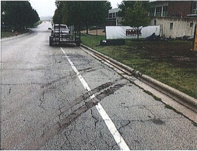
Sent from my iPhone